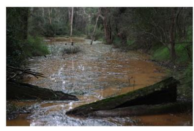
Runoff from Mt Gilead to Noorumba Reserve, Menangle Creek & Nepean River 8th March 2022 and 23rd May 2022