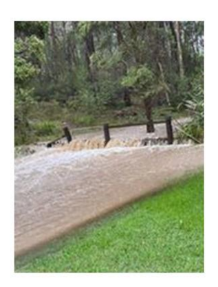
Appin Village Statement from a resident

Camden 1977 & 1988 I spoke to two business people one in the middle of the main street said he could not obtain flood insurance and another whose premises were flooded this month said he would claim this time but he doubted he would be able to afford insurance next year and also said that the floods in 1956 were much worse Homes were also flooded